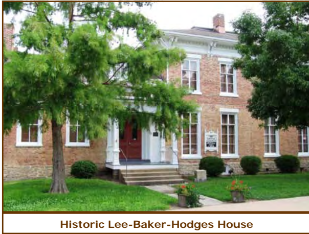
Historic Lee-Baker-Hodges House