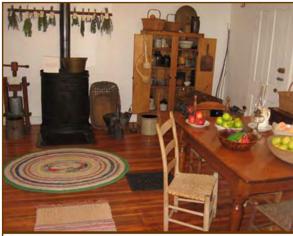
Kitchen Exhibit Featuring Refinished Floor

Much needed renovations began several years ago to the first floor of the Lee-Baker-Hodges House, home of the Greene County Historical and Genealogical Society and Museum. Work is now complete on the heating & a/c and electrical wiring in the entire building, period correct folding blinds have been installed in all windows, all first level rooms and one second level room were renovated and painted and half of the first level floors were refinished. Also, additional bookshelves were added to the library.