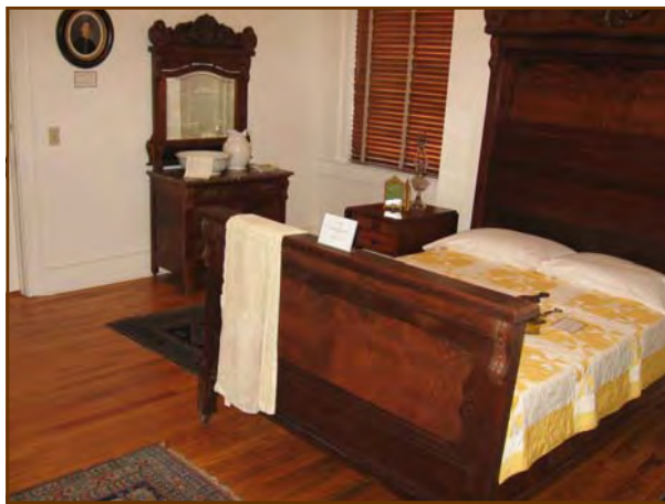
First Floor Bedroom Exhibit

The estimated cost for all that remains to be done is $80,000.